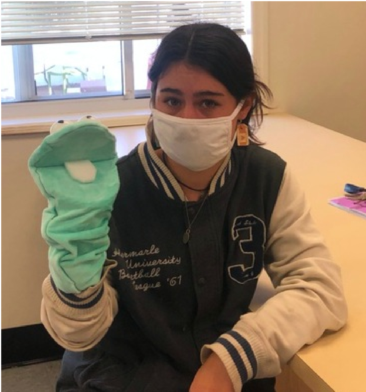
Prospective Students created puppets to take home

Our next Live Open House will have a similar format and is scheduled for January 30. Since space will continue to be limited, please encourage potential new LIHSA families to sign-up and reserve their spot early by clicking here.