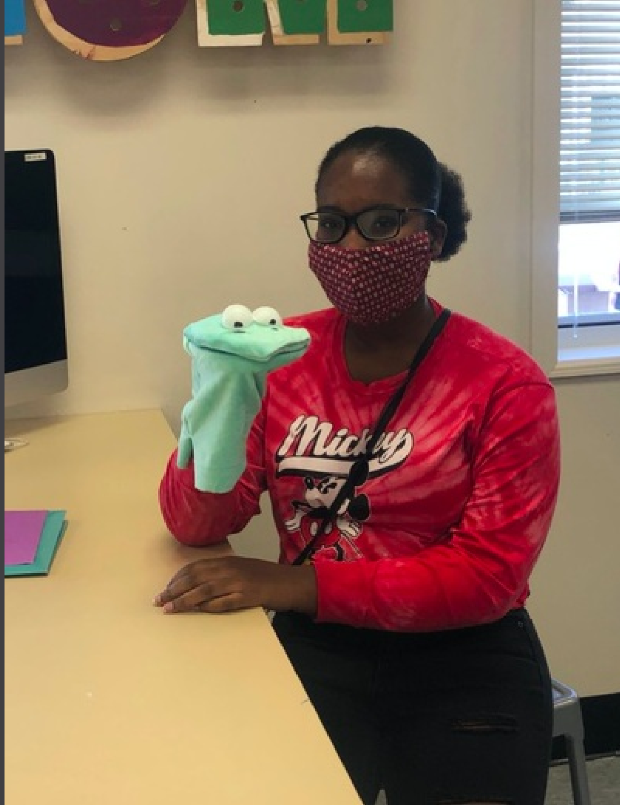
Prospective Students created puppets to take home