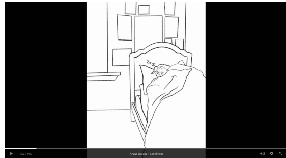
Anays Sarauz created a pandemic related animation and role her bedroom played as she stayed there daily for months