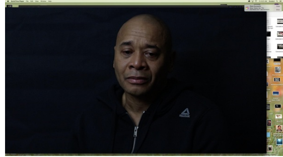
David McDowell created a documentary on 9/11 and NYC