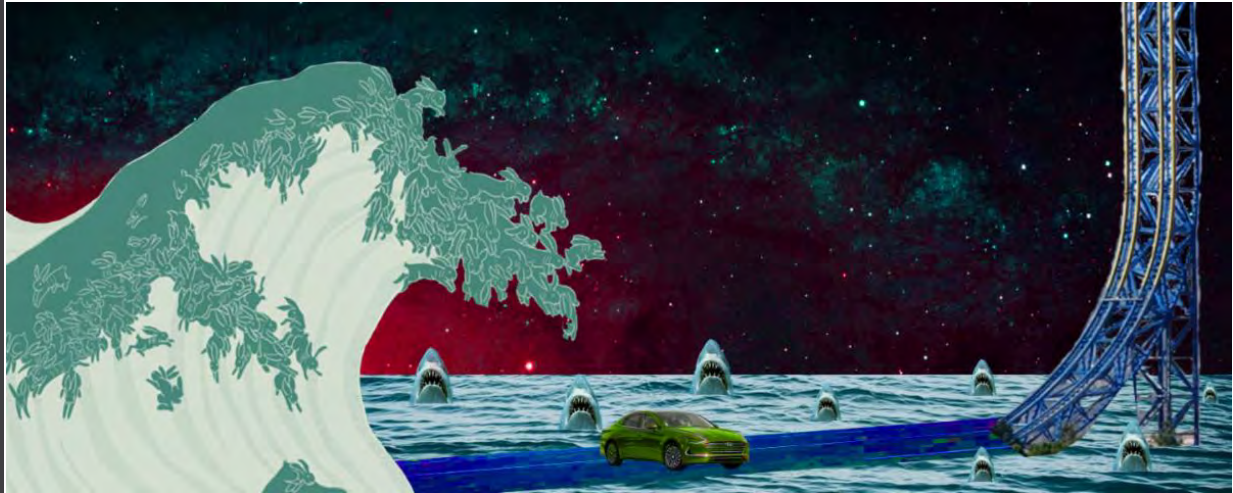
Work by Diane Lincifort

Dreams allow us to shift from traditional narrative to non-narrative or fictitious approaches and employ concepts of the surreal, absurd and the imaginary. This project challenged students to consider ways to adapt the dream to a visual language and explore visual effects for the dream's world.