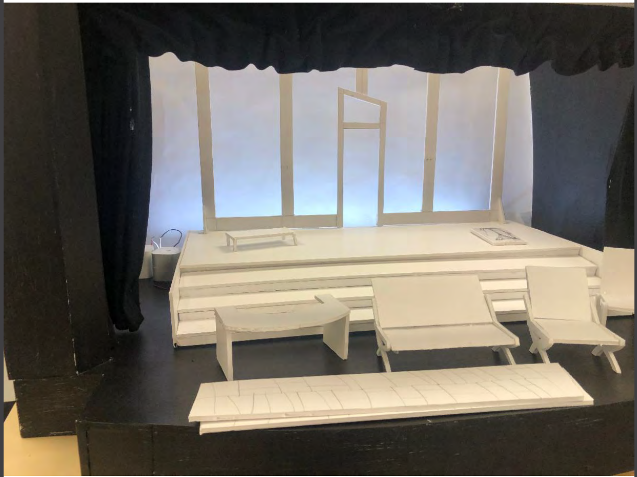
AM student Andrew Defrin's model on the stage with uplighting from a series of LED modules.