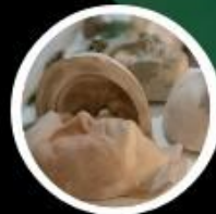
PRODUCTION & MANAGERIAL ARTS