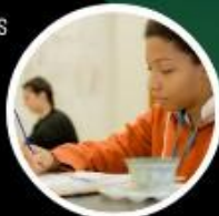
VISUAL & MEDIA ARTS