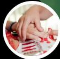
EXPRESSIVE ARTS & HUMAN DEVELOPMENT