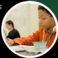
VISUAL & MEDIA ARTS