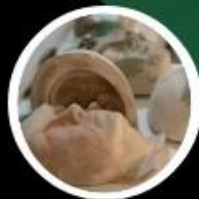
PRODUCTION & MANAGERIAL ARTS