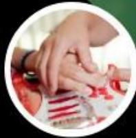
EXPRESSIVE ARTS & HUMAN DEVELOPMENT