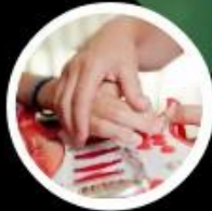
EXPRESSIVE ARTS & HUMAN DEVELOPMENT