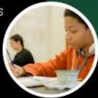
VISUAL & MEDIA ARTS