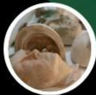
PRODUCTION & MANAGERIAL ARTS