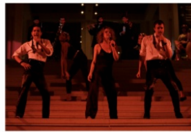
MY BARBARIAN OCT 29, 2021-FEB 27, 2022