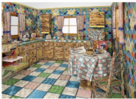
MAKING KNOWING: CRAFT IN ART, 1950- 2019 NOV 22, 2019-FEB 2022

Looking for some new art to view over the holiday break? Check out the Whitney Museum 's current exhibits.