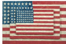
JASPER JOHNS: MIND/MIRROR SEPT 29, 2021-FEB 13, 2022