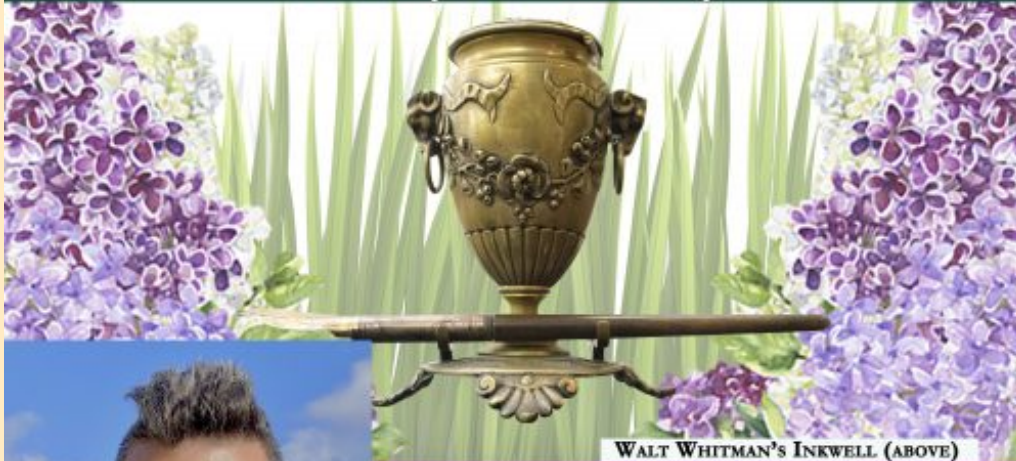
WALT WHITMAN'S INKWELL (ABOVE)