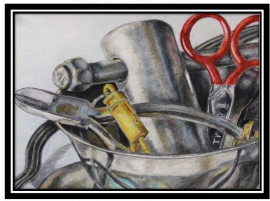
You are invited to participate in the annual Long Island High School for the Arts