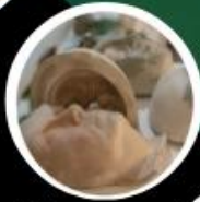
PRODUCTION & MANAGERIAL ARTS