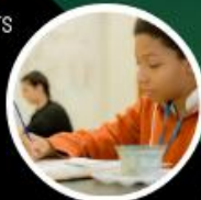
VISUAL & MEDIA ARTS