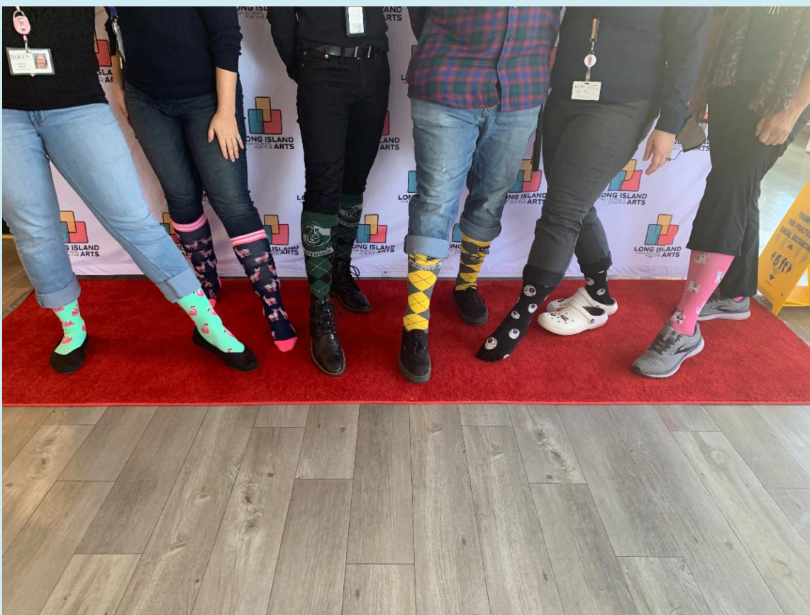
Our Art Students are "Decking Our Halls"