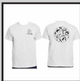
LIHSA T-SHIRT $15.00 WHITE WITH BLACK LIHSA LOGO