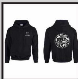
LIHSA HOODIE $30.00 BLACK WITH WHITE LIHSA LOGO