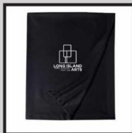
LIHSA BLACK BLANKET $30.00 BLACK W/ WHITE LIHSA LOGO