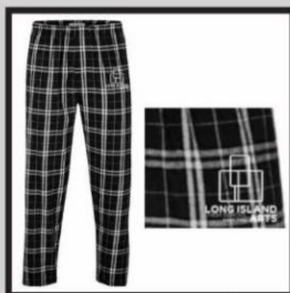
LIHSA PAJAMA PANTS $35.00 BLACK PLAID W/ WHITE LIHSA LOGO