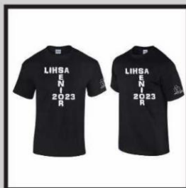
LIHSA SENIOR T-SHIRT $10.00 BLACK WITH WHITE PRINTING