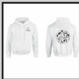
LIHSA HOODIE $30.00 WHITE WITH BLACK LIHSA LOGO