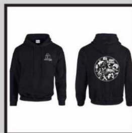
LIHSA HOODIE $30.00 BLACK WITH WHITE LIHSA LOGO