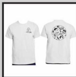
LIHSA T-SHIRT $15.00 WHITE WITH BLACK LIHSA LOGO