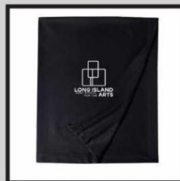
LIHSA BLACK BLANKET $30.00 BLACK W/ WHITE LIHSA LOGO