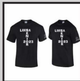
LIHSA SENIOR T-SHIRT $10.00 BLACK WITH WHITE PRINTING