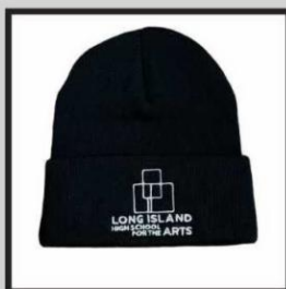
LIHSA BEANIE $20.00 BLACK WITH WHITE LIHSA LOGO -OR- WHITE WITH BLACK LIHSA LOGO