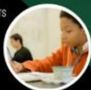
VISUAL & MEDIA ARTS