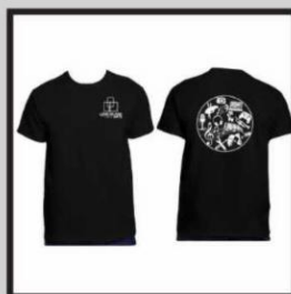
LIHSA T-SHIRT $15.00 BLACK WITH WHITE LIHSA LOGO