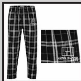
LIHSA PAJAMA PANTS $35.00 BLACK PLAID W/ WHITE LIHSA LOGO