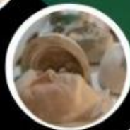
PRODUCTION & MANAGERIAL ARTS