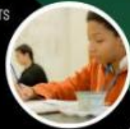
VISUAL & MEDIA ARTS