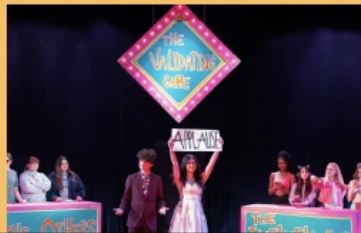
Stage Lighting & Set Design