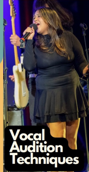
Vocal Audition Techniques