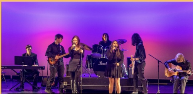
The Art of the Band Improvisation & Performance Techniques