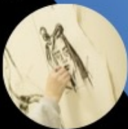
Visual & Media Arts