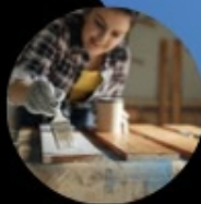
Production & Managerial Arts